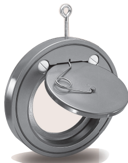
(W/ Spring) (有彈簧) JT 300S